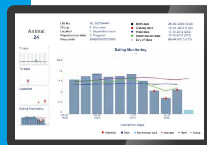
Graph with Reduced Eating Behaviour alerts: eating behaviour over last 10 days

Nedap Heat Detection with Eating Monitoring gives you the famous, high-precision Nedap Heat Detection RealTime 24/7 and at distances of up to 500 metres around the antenna. Nedap Eating Monitoring is a major advance in the automatic tracking of each individual animal's health and well-being. It records the time each day an animal takes in roughage or grazes. Changes in this eating behaviour tell you that there may be something wrong with the animal and that it needs further attention. So you are always aware of any potential health problems at an early stage and you can avoid any serious negative consequences such as a drop in production or high treatment and culling costs. Nedap Eating Monitoring also enables you to keep an extra close eye on your animals during the vulnerable period around calving, when they are more susceptible to diseases due to changes in their environment, feed, energy balance and stress.